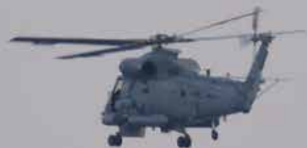
Photo: HMNZS TE MANA's Seasprite helicopter conducts flying operations from HMNZS AOTEAROA.

The sea phase was extremely valuable for both units with TE MANA using the concentration of assets to conduct operational evaluation of the Frigate Systems Upgrade equipment and systems. TE MANA's leadership team also gained valuable experience filling a range of Commander Task Group (CTG) staff roles that controlled and coordinated the collective efforts of the seven ships, two aircraft and approximately 800 sailors and aviators.