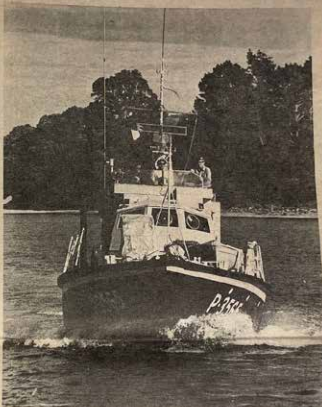
One of New Zealand's four naval fisheries protection vessels, HMNZS Haku. Their armaments: Three .303s and the skipper's pistol. They have something like 2000 miles of coastline to patrol, but with the help of other naval vessels, the Air Force, other New Zealand fishermen and the Police Department, seem to do extremely well. Top speed is 11.5 knots but they normally patrol at 10.5 knots.