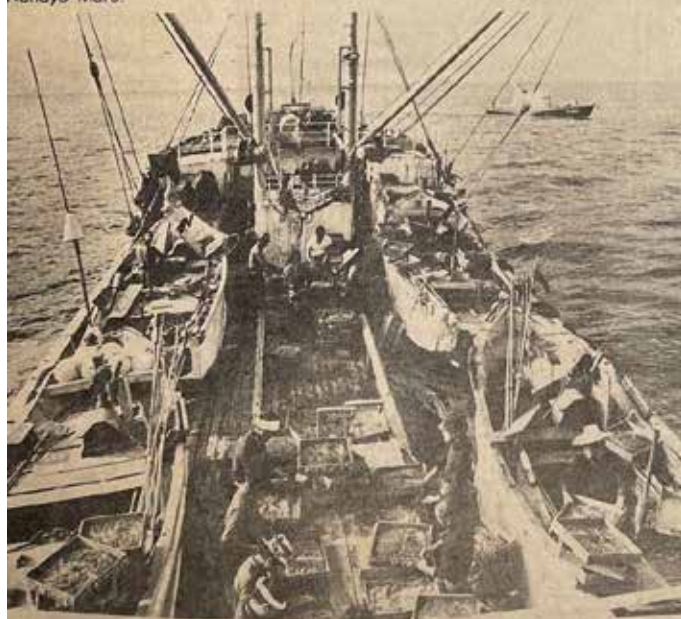
Left: The Japanese on the forward deck baiting 16,000 hooks with squid from Hokkaido for the next day's snapper catch. There are 100 hooks to a line and each of the four dories on deck sets 40 lines. The fishermen work a minimum 15-hour day.