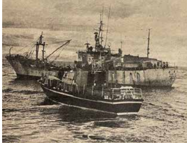
The Haku, neat and trim, approaches the 453-ton long-line snapper boat, Nanayo Maru.

Fishery protection launches of the Royal New Zealand Navy have one major purpose — to see that restrictions imposed on trawlers and other vessels fishing in New Zealand waters are observed. Under a New Zealand-Japan agreement, 17 Japanese long-line snapper fishing boats are permitted to fish between the six and 12-mile limits, and the navy launches' work naturally includes keeping a watch to see that the long-liners keep to their bargain. Pictures on these pages were taken by Wellington Staff Photographer BARRY DURRANT during a patrol by the fishery protection launches Haku and Kahawoi out of Tauranga.