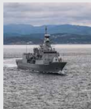
Front Cover: HMNZS Te Mana departs Canada.

Changing Address? To join or leave our mailing list, please contact: Email: navytoday@nzdf.mil.nz