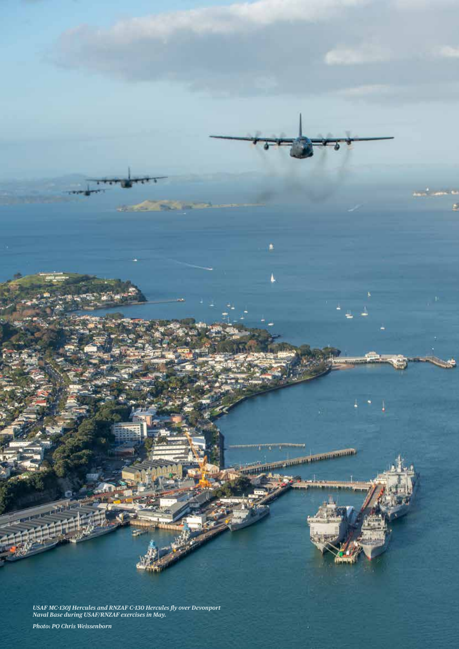
USAF MC-130J Hercules and RNZAF C-130 Hercules fly over Devonport Naval Base during USAF/RNZAF exercises in May.