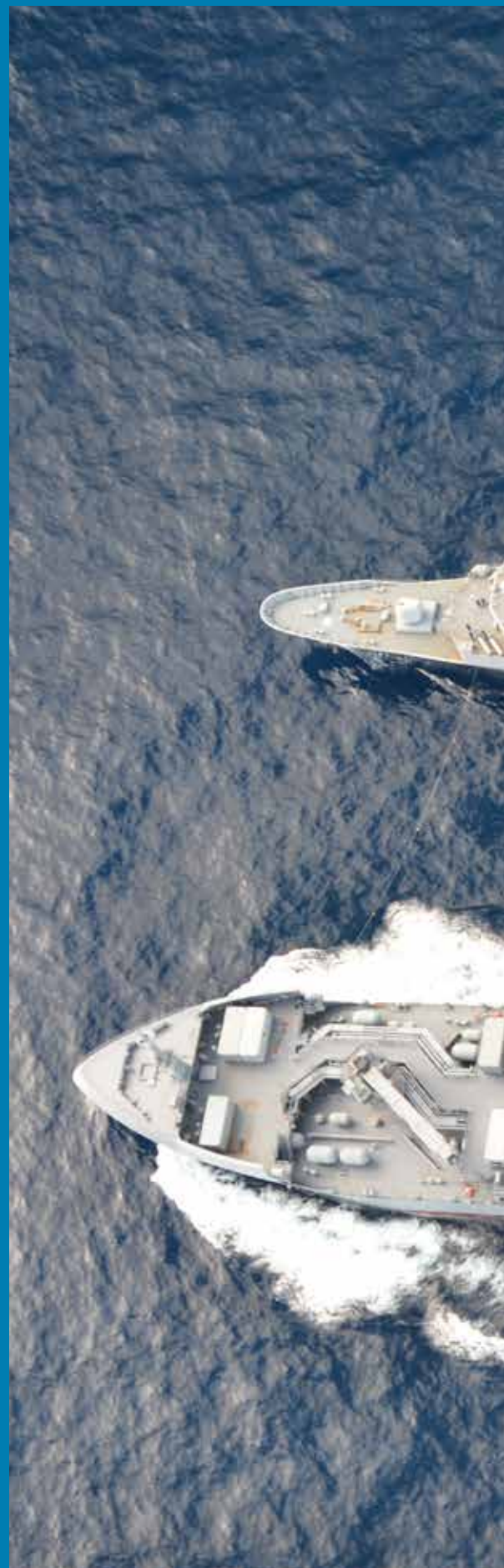
The view from the cockpit of AOTEAROA's embarked Seasprite helicopter, as TE KAHA takes on fuel from AOTEAROA.

A unique moment for TE KAHA occurred on a later day, when a Hands to Bathe was called at Challenger Deep, the deepest known point on the earth at nearly 11km down.